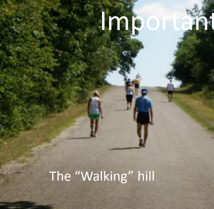
The "Walking" hill