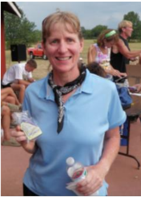
Howl Virgin - completed first marathon and ultra!